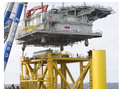
Horns Rev B - installation of topside