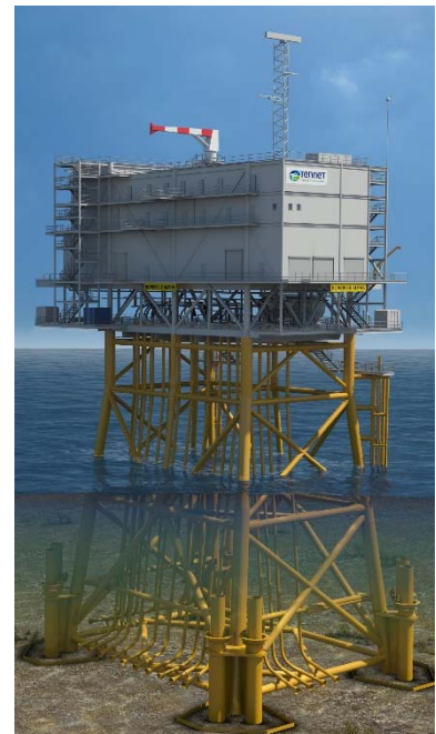
Borssele – under construction