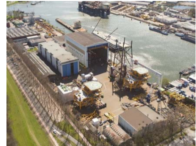
HSM Offshore yard