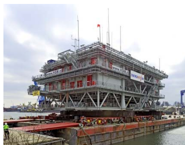
Horns Rev C - load-out