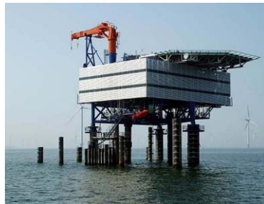
Horns Rev A - in operation