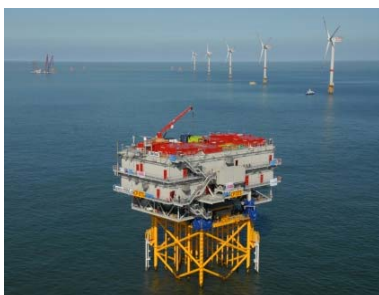
Thornton Bank - installed