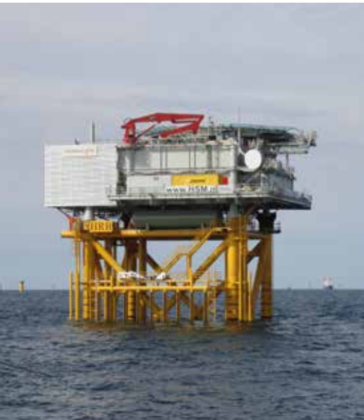
OHVS 250 MW