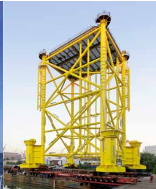
Jacket 1,050 tonnes