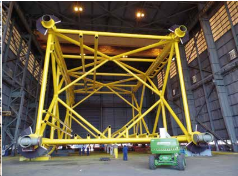
HSM Offshore Facilities in Rotterdam harbour