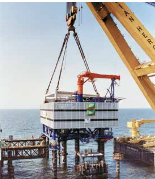
First OHVS project 2002

The Quality, Safety and Environmental Management systems have been independently audited and certified for more than 20 years.