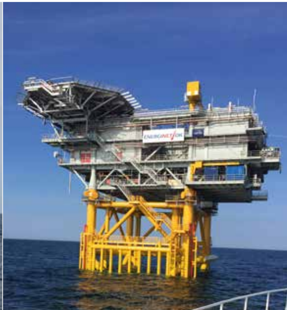
OHVS 400 MW