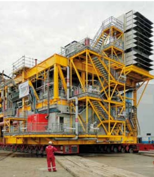
Compression module 1,600 tonnes

For client convenience, the provision of temporary accommodation, construction support and offshore transportation can be arranged as well.