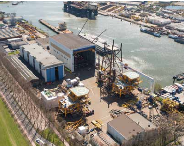
HSM Offshore facilities in Rotterdam harbour