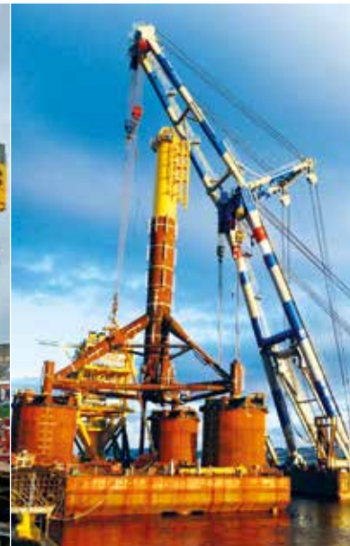
Re-usable platform with suction piles