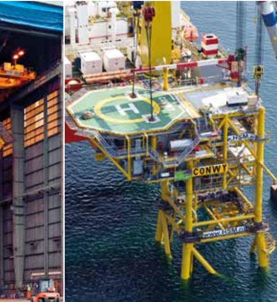
Transport & Installation

The Primavera P6 planning programme has been fully implemented and allows close progress monitoring and comprehensive reporting.