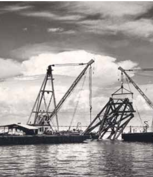
First project 1962

An extensive pool of qualified welders as well as reputable subcontractors for E&I, Piping and Heavy Lift services are based in the direct vicinity of HSM Offshore premises.