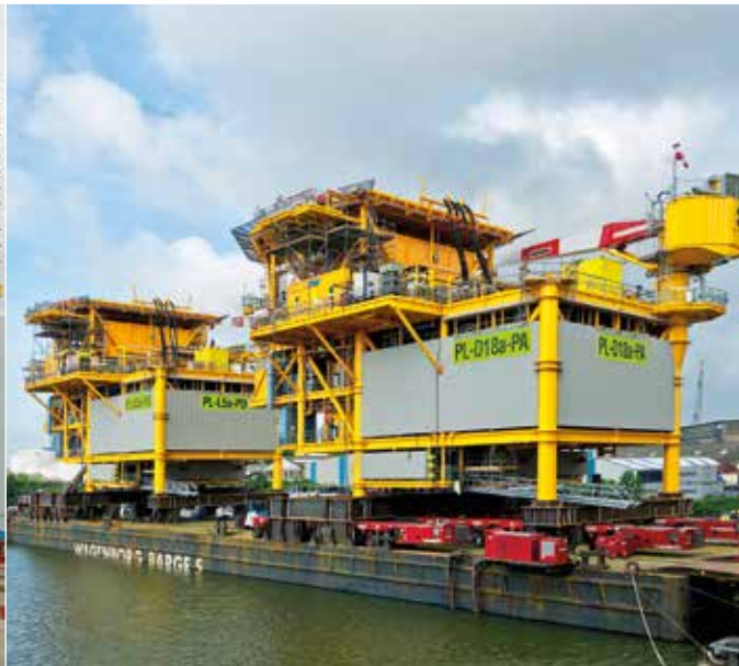
Two gas platforms delivered within one year