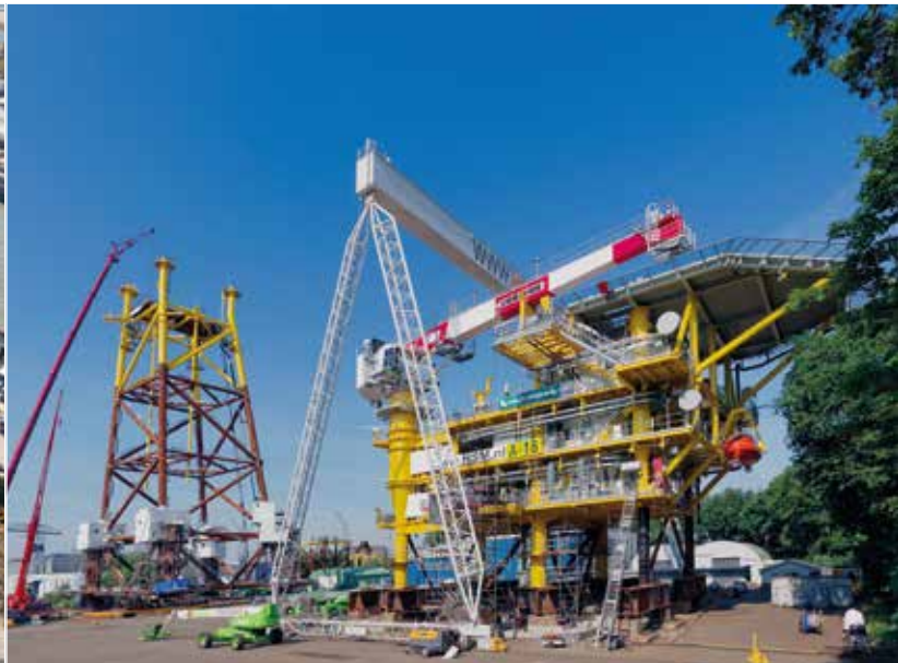
EPCI gas platform